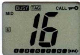
The photo shows actual display size.

* 35x24 mm, 1 3/8 x 1 5/16 in. dimensions