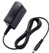
BC-199S* Charges BP-266 in 8.5 hours (approx.).