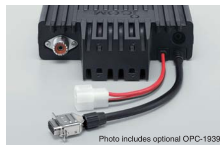
Photo includes optional OPC-1939

With the optional OPC-1939 D-SUB 15-pin ACC cable, the IC-F5026/H series can be programmed to control an operating channel from an external device (up to 16 preprogrammed channels). The ACC connector also provides an ignition sensing function, external PTT, PC command, horn honk, audio output and modulated signal input depending on programming.