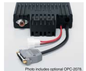
Photo includes optional OPC-2078.

The optional ACC cable allows you to connect with various external devices to control audio output, modulated signal input, remote channel control, horn honk and many more functions. OPC-1939 is a D-SUB 15-pin type and OPC-2078 is a D-SUB 25-pin type.